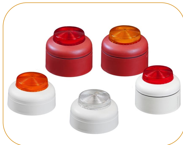
Vantage LED Beacons