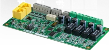
4 Way Audio Splitter (154-0280)