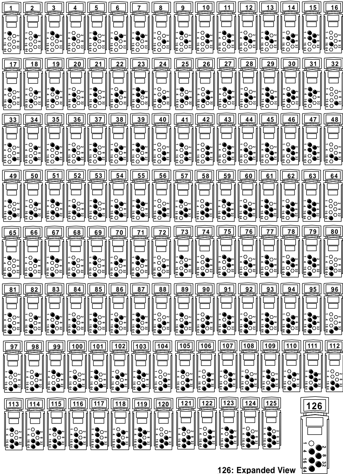
126: Expanded View

Select the desired address and remove the pips indicated in black. Remove pips with a small screwdriver.