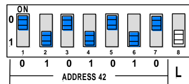
Figure 1: Example of Sounder Addressing and Sounder Output Level Setting

The address of the sounder is set using seven segments of the eight- segment DIL switch. The eighth segment is used to adjust the sounder output level. Segments 1- 7 of the switch are set to "0" (ON) or "1", using a small screwdriver or similar tool. A complete list of address settings is shown in on Page 3. If a detector is to be fitted, set the Xpert Card address as described on Page 2.